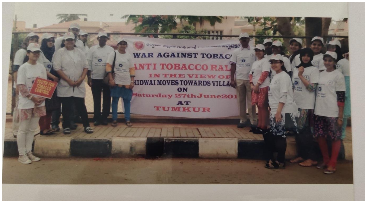
No tobacco day